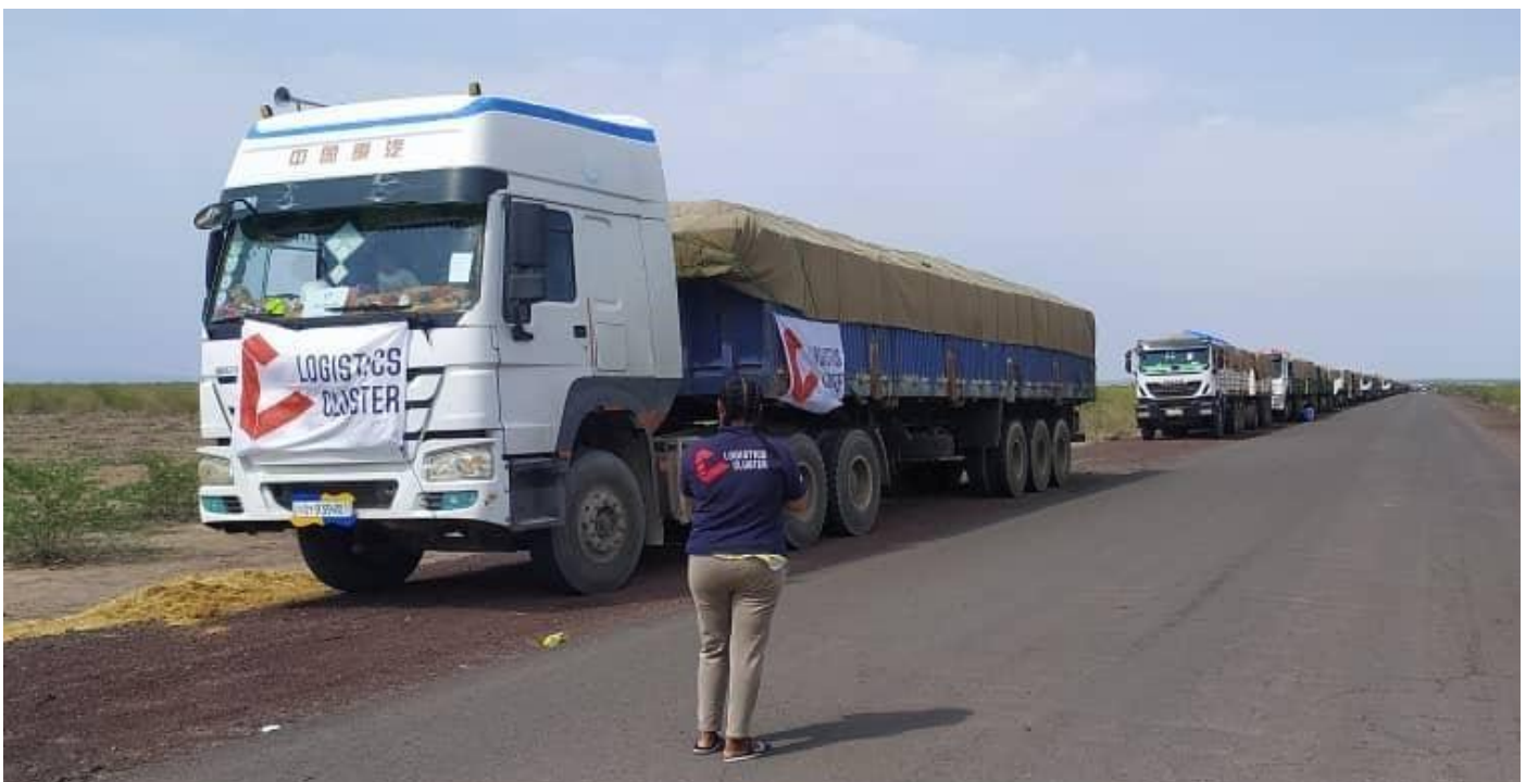
A humanitarian convoy en route from Semera (Afar) to Mekele (Tigray).