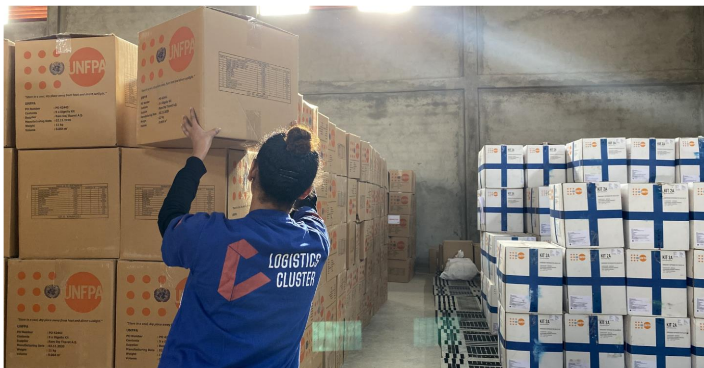
A stock keeper at the warehouse in Mekele (Tigray).